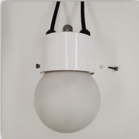
9B. (Reference only) - shown without housing