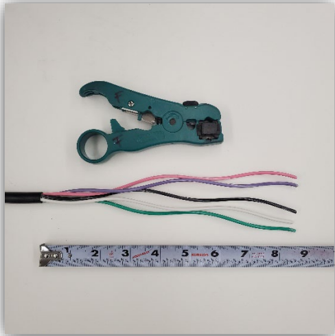
6. Remove cable(s) and strip 9"