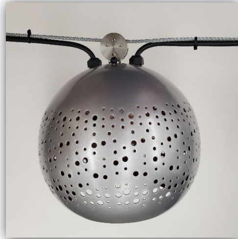
7. Re-install power cables and tighten cordgrips