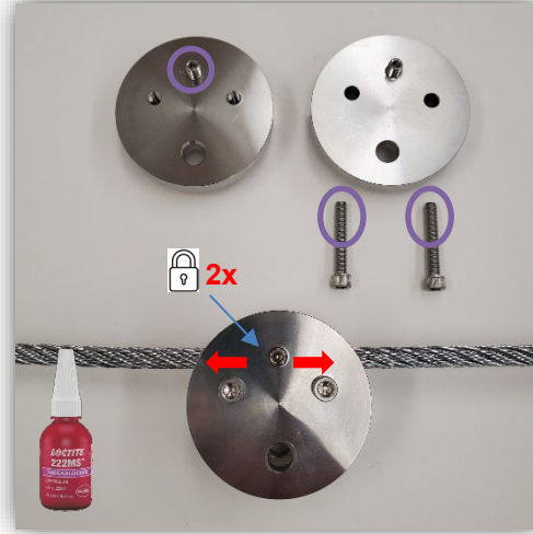
1. Install Hanger (Purple Loctite™ Supplied)