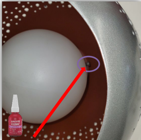
9A. Install LED to wire compartment with thumb screws (2) (Loctite)