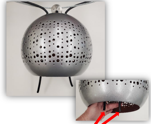
5. Feed power cable and/or cut at aperture