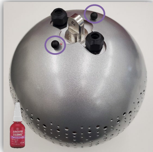
3. Assemble wire compartment to housing (Loctite)