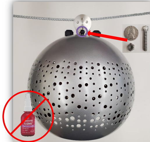
4. Attach to hanger - Do NOT use Loctite with nyloc nut