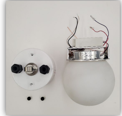
2. Partially dis-assemble LED