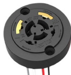
TL5 & TL7