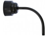
E15 | 16 3/8" x 10 1/2"