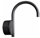
WM40 | 13 7/8" x 14 3/4"

Dimensions are Projection x Height Click here for all Wall Mount styles