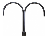
PM20 | 30 1/8" x 25"