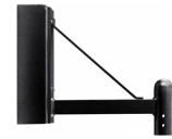
WM317 | 15" x 12 3/4"