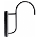
WM74 | 22" x 26 1/2"