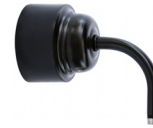
E26 | 11 1/8" x 6"