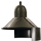
HSS90 & HSS120