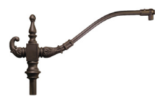
PA8453 / 70" x 37 1/2"