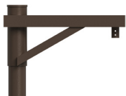
PA3113 / 25" x 15 1/4"