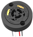
TL5 & TL7