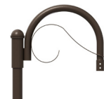
PA2023 / 21 1/4" x 16"