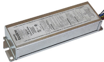
EMG-LED10, 20, 30