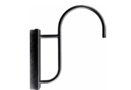
WM74 | 22" x 26 1/2"