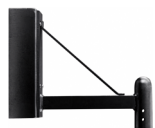
WM317 | 15" x 12 3/4"