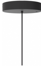
DCCEM (12" x 1 1/2") Cord Only