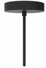
DCCEM (12" x 1 1/2")