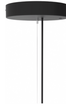
DCCEM (12" x 1 1/2") Cable/Cord Only