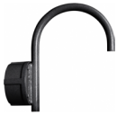
WM40 | 13 7/8" x 14 3/4"

Dimensions are Projection x Height Click here for all Wall Mount styles