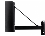
WM317 | 15" x 12 3/4"