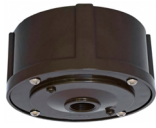
RTCNCC (5 7/8" OD x 2 5/8" H)