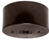
SRTCC (6" OD x 2 7/8" H)