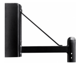
WM317 | 15" x 12 3/4"