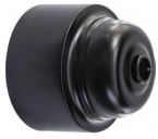
RTCW (6 1/2" OD x 5 5/8" H) Wall Only (E-arms)