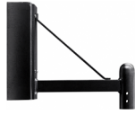
WM317 | 15" x 12 3/4"