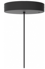
DCCEM (12" OD x 1 1/2" H) Cord Only