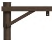
PA3113 / 25" x 15 1/4"