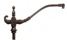
PA8453 / 70" x 37 1/2"