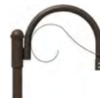
PA2023 / 21 1/4" x 16"