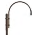
PA2613 / 39 1/2" x 46"