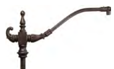
PA8453 / 70" x 37 1/2"