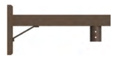
WM3003 / 11" x 8 7/8"