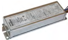
EMG-LED10, 20, 30