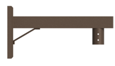
WM3003 / 11" x 8 7/8"