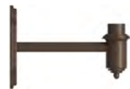
WM5603 / 17 7/8" x 14"