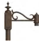
PA8033 / 20 1/2" x 20 1/4"