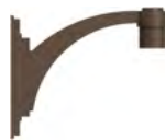
WM5163 / 15 3/4" x 13 3/4"