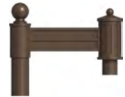
PA8523 / 18 1/4" x 14 1/2"