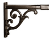
WM5313 / 10 7/8" x 10"