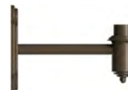
WM5601 / 17 7/8" x 14"