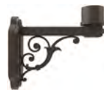
WM5311 / 10 7/8" x 10"