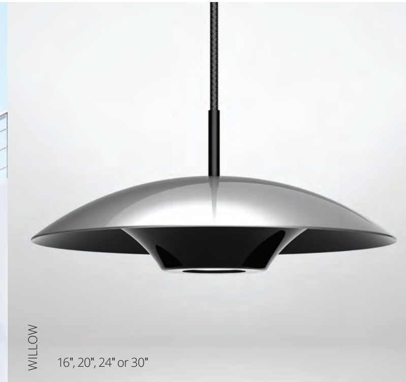
WILLOW 16", 20", 24" or 30"