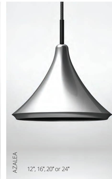
AZALEA 12", 16", 20" or 24"