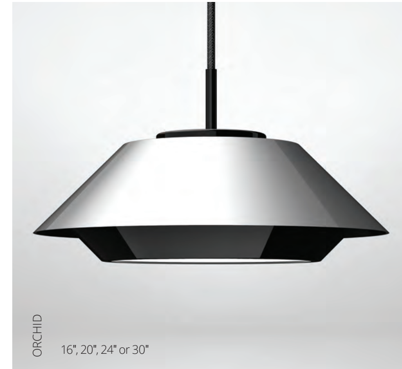
ORCHID 16", 20", 24" or 30"