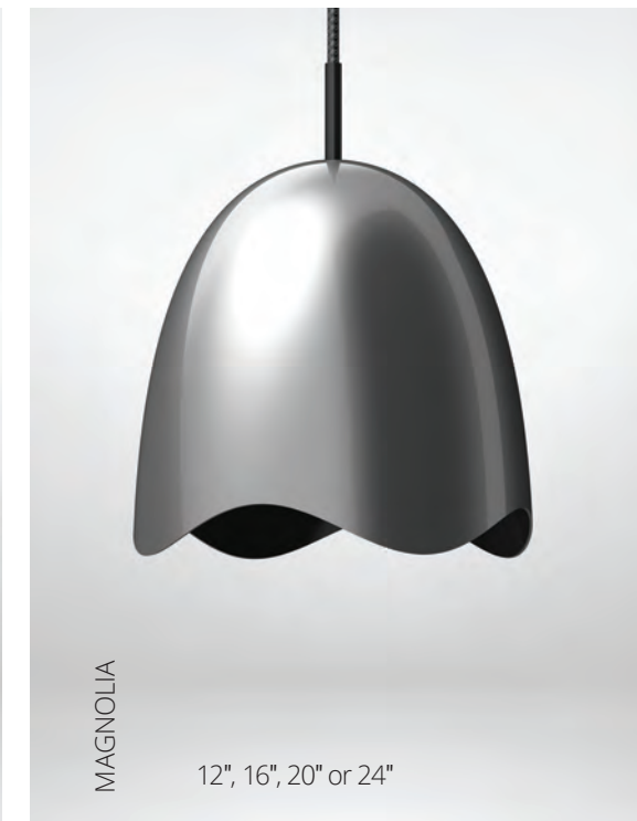
MAGNOLIA 12", 16", 20" or 24"

Pairing design aesthetics with balanced illumination, the M+D Collection's versatile pendant luminaires have just the right look and proportion for office spaces, restaurants and bars, hotels, retailers, and campuses.