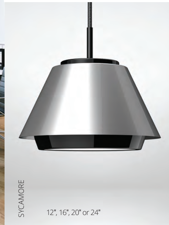
SYCAMORE 12", 16", 20" or 24"